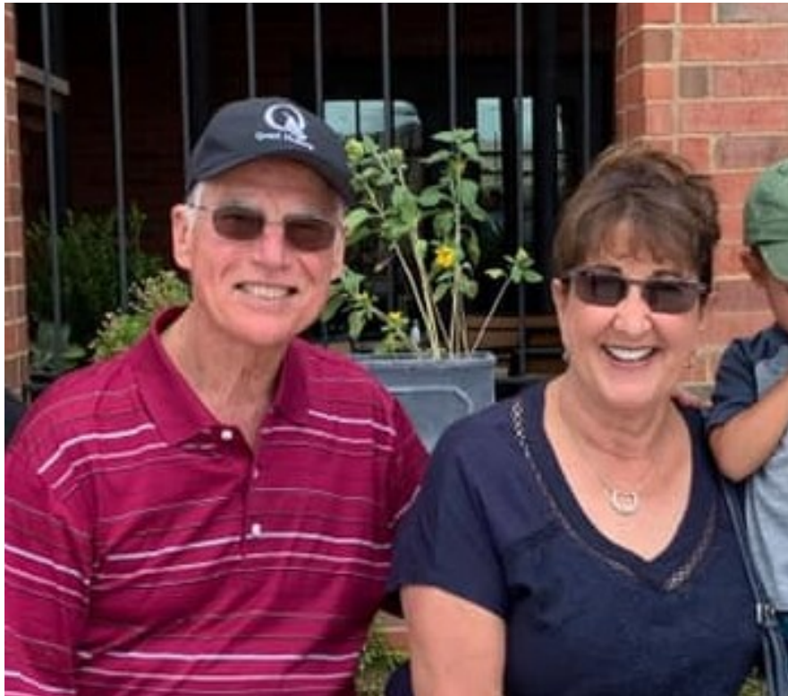
Here are Mom and Dad.

Dad brings me a Zero Pepsi on Wednesday .